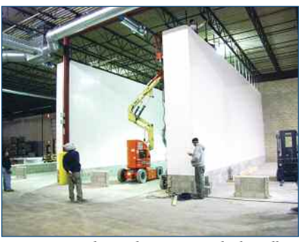
17 Foot High Panels on 2 Foot Block Wall