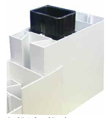
Steel Reinforced Panel Section Detail