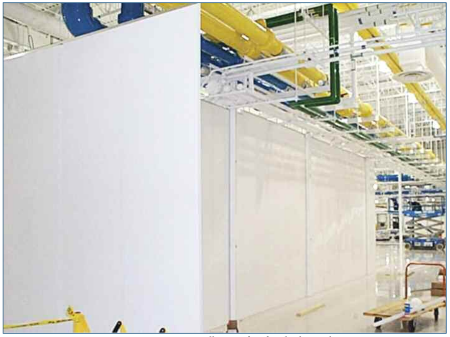
Process Room – Installation of 12 foot high panels.

Use in Clean Rooms, Food Processing, Packaging, Bottling Plants, Car Washes, Agricultural Facilities, Cheese and Milk Plants, or anywhere partition walls are required.