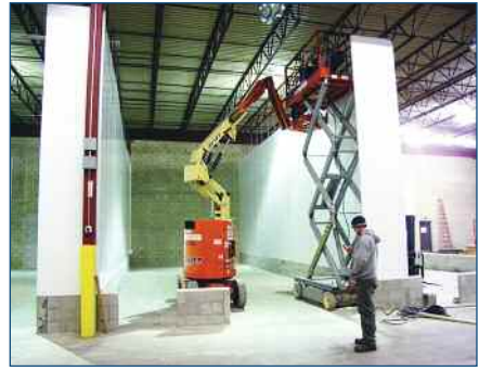
Steel Reinforced Attached to Building Structure