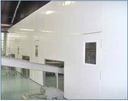
12 Foot High Wall with Double Swing Doors and Conveyors for Process Room