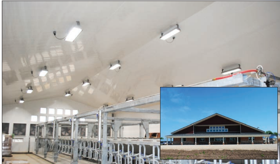
Dairy Parlor with FORM Walls