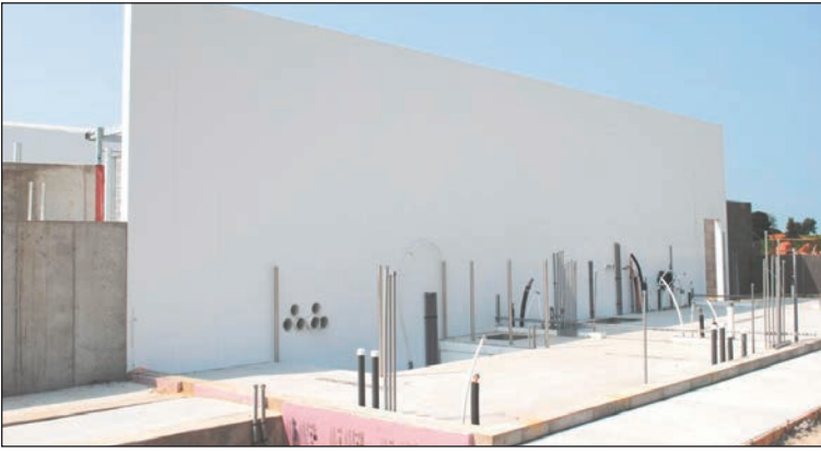
P624 - 6" THICK CONCRETE FORM WALL

Extrutech FORM System allows a great deal of design options, giving you wall thickness options from 6" to 10", and insulation methods that provide up to a *R-22. Extrutech manufactures the FORMS to your drawing specifications up to 20' long. Each panel is labeled to a layout drawing. You receive a pre-cut panel kit ready for erection. Window and door passages can be pre-cut. Assembly involves snapping panels together, bracing, installing locking splines and rebar, pouring cement, letting cure – finished wall!