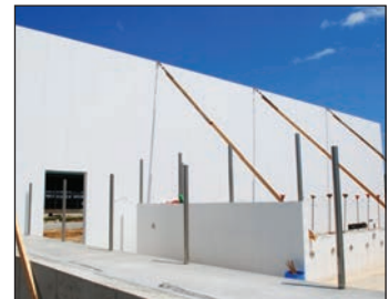
Extrutech FORM Walls