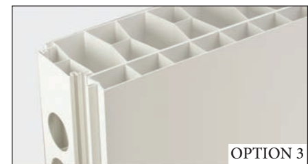
P824 - 8" CONCRETE FORM