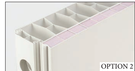
P624i - 6" INSULATED FORM