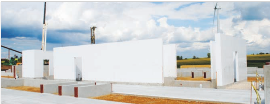
4-Room Robotic Milking Parlor

Provides a pre-finished 10" thick wall with a bright clean surface on both sides. For use as an exterior wall.