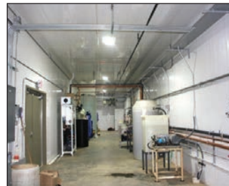
Car Wash Equipment Room