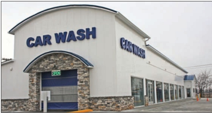
Car Wash – P624 - 6" THICK CONCRETE FORM