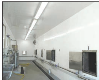
Milk Transfer Room