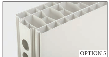
P1024 - 10" CONCRETE FORM