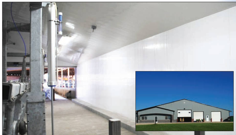
Dairy Parlor with FORM Walls