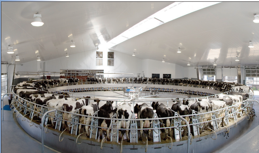
Milking Parlors with Extrutech FORM Wall System and Extrutech Liner Panels Ceiling

Extrutech FORM System is a "stay-in place" concrete form for poured walls. It is a quick setup, pre-cut system, that provides a smooth, non-porous, easy-to-clean, finished concrete structural wall in 6", 8" and 10" thick panels. Insulated panels are also available. Ideal for high moisture areas where sanitation is critical; making the Extrutech Form System a labor saver for both the contractor and owner.