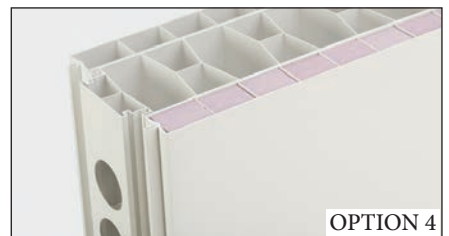
P824i - 8" INSULATED FORM