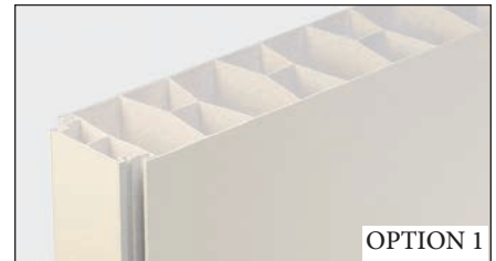
P624 - 6" CONCRETE FORM

Providing the design options your projects demand with a number of panel features, colors and sizes.