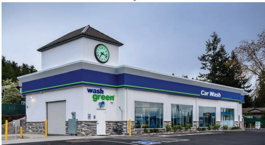
Car Wash in Seismic Zone Using Extrutech FORM Panels

Extrutech manufactures the FORMS to your drawing specifications, up to 20' long. Each panel is labeled to a layout drawing. You receive a pre-cut panel kit ready for erection. Window and door passages can be pre-cut. Assembly involves snapping panels together, bracing, installing locking splines and rebar, pouring cement, letting cure – finished wall!