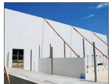
Extrutech FORM Walls