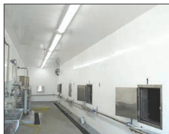
Milk Transfer Room