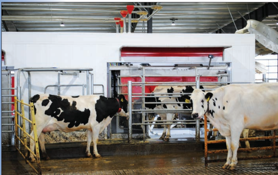
Robotic Milking Room with Extrutech FORM Wall System and Ceiling Liner Panels

Our FORM System is a "stay-in place" concrete form for poured walls. It is a quick setup, pre-cut system, that provides a smooth, non-porous, easy-to-clean, finished concrete structural wall in 6" and 8" thick panels. Insulated panels are also available. Ideal for high moisture areas where sanitation is critical, making the Extrutech Form System a labor saver for both the contractor and owner.