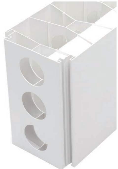
P824i-8 Insulated FORM