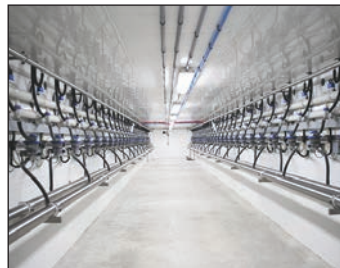
Milk Transfer Tunnel