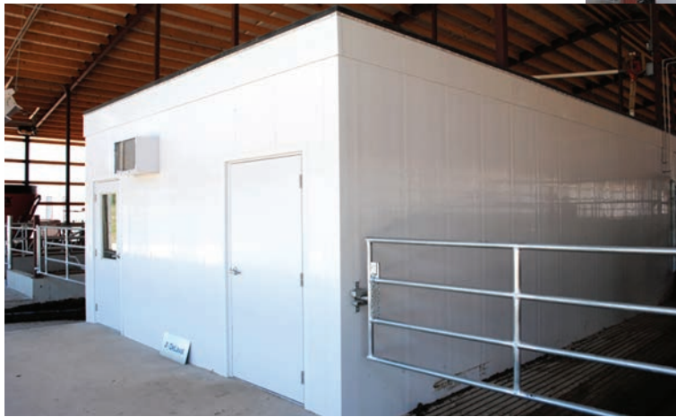
Robotic Milking Room Using Extrutech FORM Panels

Extrutech manufactures the FORMS to your drawing specifications, up to 20' long. Each panel is labeled to a layout drawing. You receive a pre-cut panel kit ready for erection. Window and door passages can be pre-cut. Assembly involves snapping panels together, bracing, installing locking splines and rebar, pouring cement, letting cure – finished wall!