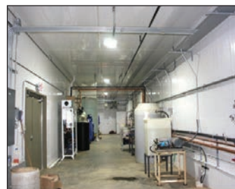
Car Wash Equipment Room