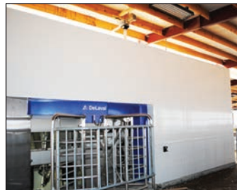
Robotic Milk Room