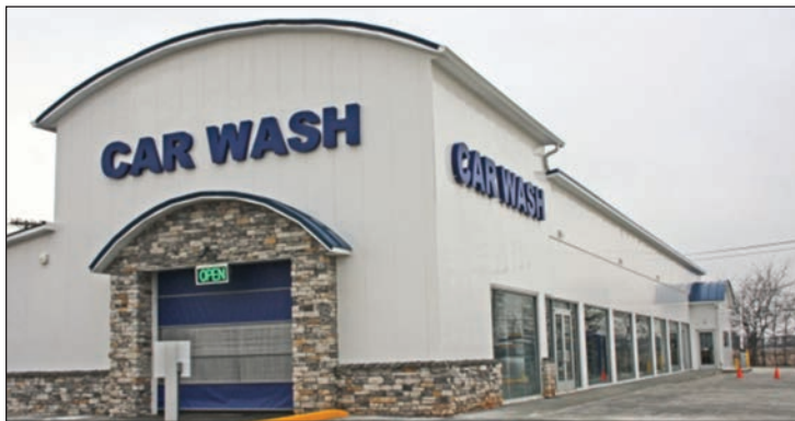
Car Wash – P624 - 6" THICK CONCRETE FORM