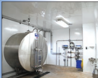
Interior of Milk Room Walls

These panels are a full two feet wide, are cut to required lengths, and snap together for quick installation. The Extrutech FORM panel offers a non-porous, water proof, prefinished, bright white surface on both sides. This finish reduces finishing and installation time while also providing an easy-to-clean, sanitary, solid, structurally sound, load bearing wall. Panels do not require applied finishes. Panels are ready for trusses, windows, and doors as soon as the concrete is cured.