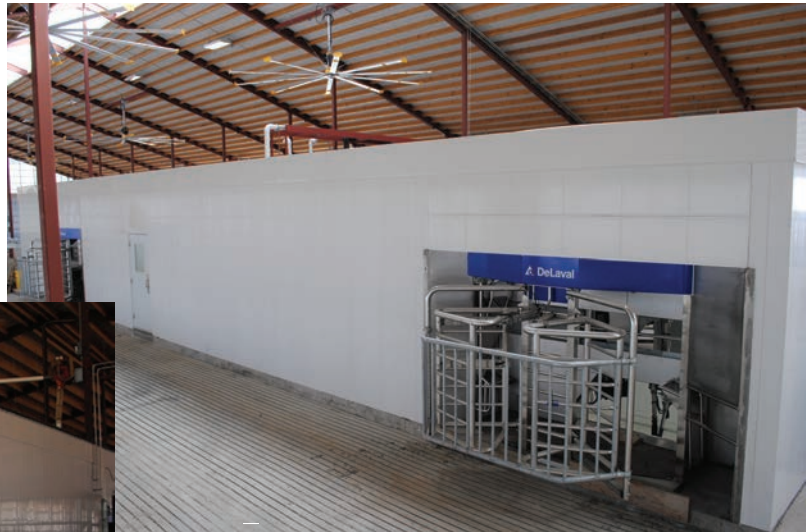
Robotic Milking Room Structure using Extrutech Stay-in-Place Concrete FORM Panels

Extrutech FORM System allows a great deal of design options, giving you wall thickness options from 6" to 8", and insulation methods that provide up to a R-22. The Extrutech FORM is ISO-9001:2015 and ICC-ES Certified.