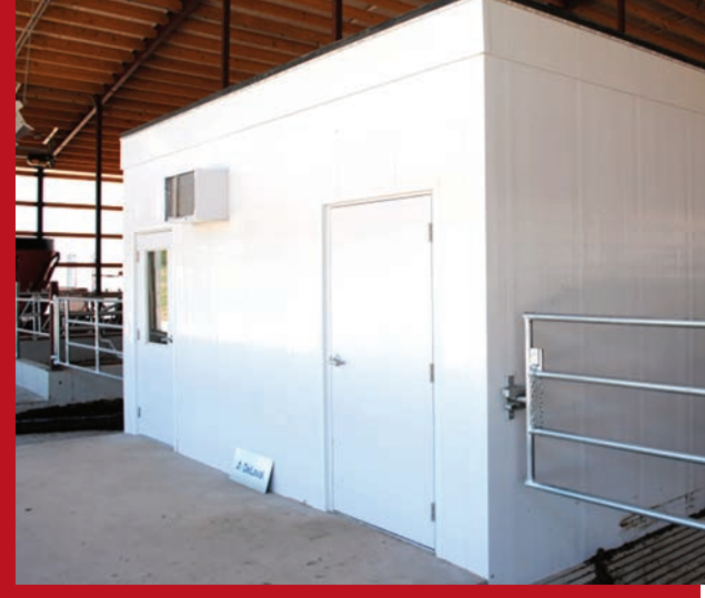
Robotic Milking Room Using Extrutech FORM Panels

Extrutech FORM System is a Stay-In-Place Concrete Form for poured walls. It is a quick setup, pre-cut system, that provides a smooth, non-porous, easy-to-clean, finished concrete structural wall in 6" and 8" thick forms. Insulated panels are also available. Ideal for areas where moisture can be a problem, making the Extrutech FORM System a labor saver for both the contractor and the owner.