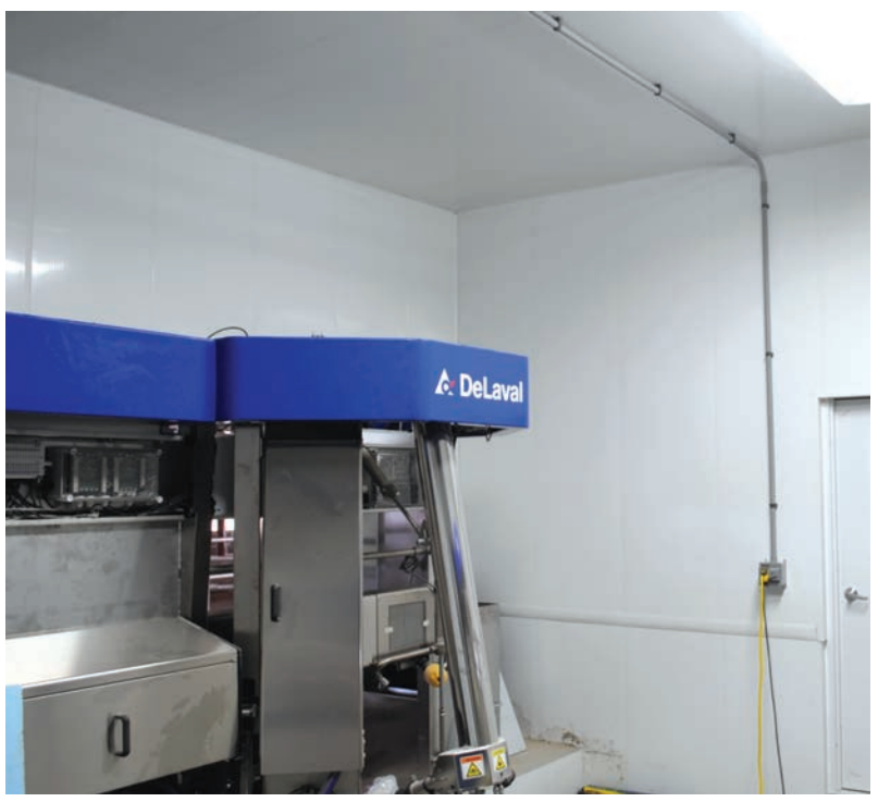
Robotic Milking Room using Extrutech FORM Walls and Ceiling Liner Panels