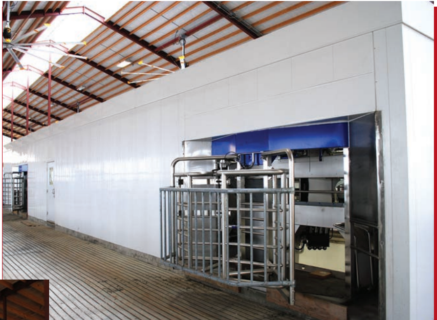
Robotic Milking Room Using Extrutech FORM Panels

6" and 8" Thick Panels U.S. Patent 8,677,713 Canadian Patent 2833,490 Mexican Patent 344,648