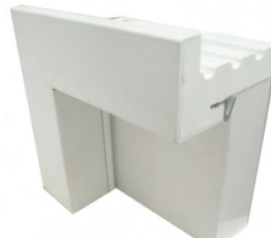
2-1/4" Door Frame OPTIONS