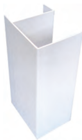
2-1/4" Slip-on Outside Corner P0226