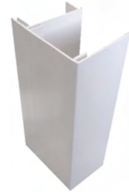
2-1/4" Fitted Outside Corner P0225

Innovative building products from Extrutech Plastics, Inc.