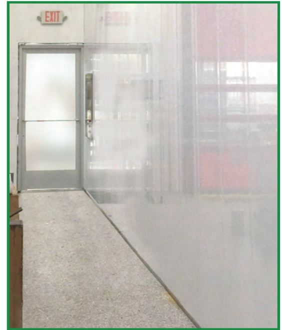
2-1/4" P224 Partition Wall Installation