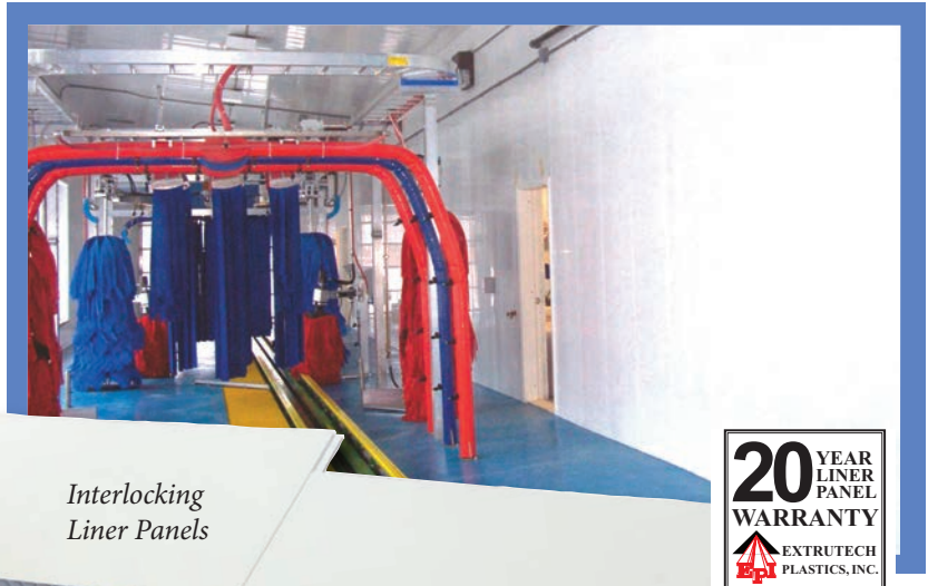
Interlocking Liner Panels

These highly-reflective, waterproof panels are ideal for high-moisture areas. Panels install quickly and easily, with no exposed fasteners. Available in widths of 12 and 16 inches for ceilings, and 24 inches for walls. Panels are custom extruded, to the inch, based on the dimensions of your building. They are stain-resistant, require little to no maintenance and are easy to clean, as necessary. Colored panels – both standard and custom – are available to further enhance your wash.