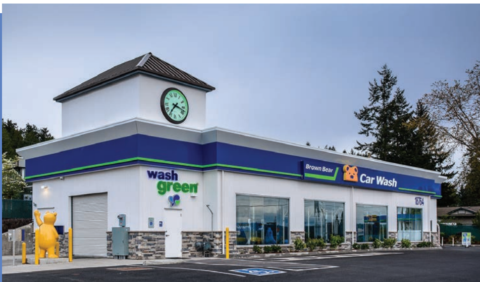
Car Wash Building Structure Using Extrutech Stay-in-place Concrete FORM Panels

U.S. Patent 8,677,713 Canadian Patent 2833,490 Mexican Patent 344,648