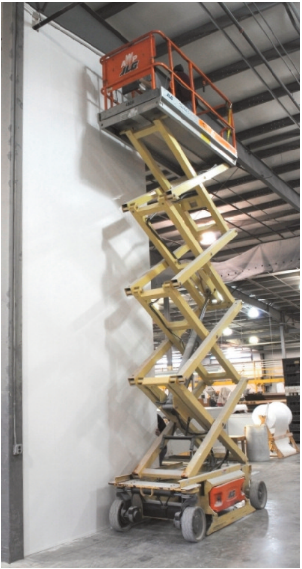
24 Foot High Partition Wall Installation

24" wide x 2-1/4" thick, cut to the inch in lengths to 24 Feet Custom made to your project specifications