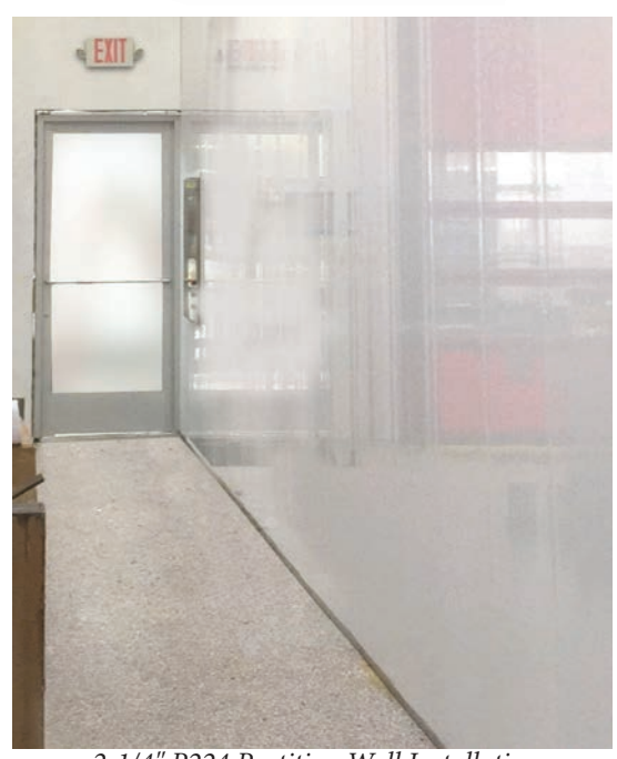
2-1/4" P224 Partition Wall Installation