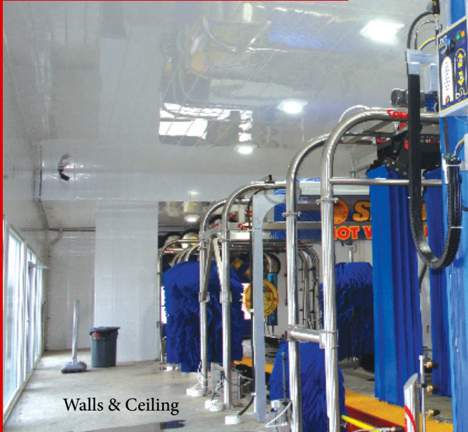
Walls & Ceiling