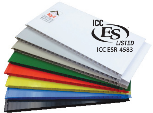
12" (P1300) Flat Panel Colors

Colored panels have a 1 year limited warranty when used in interior applications. See product warranty for details and limitations.