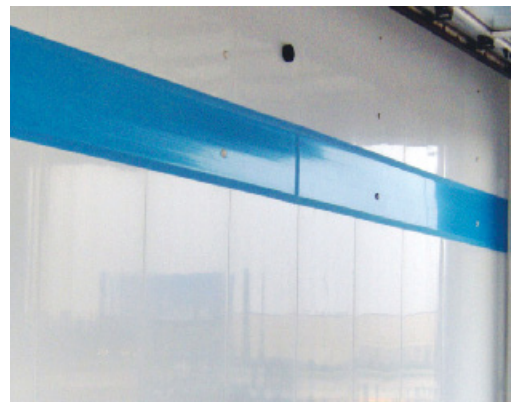
Blue Accent Panels