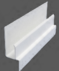
J-Trim with Drip Edge