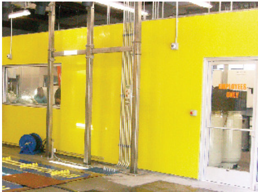
Yellow Wall Panels