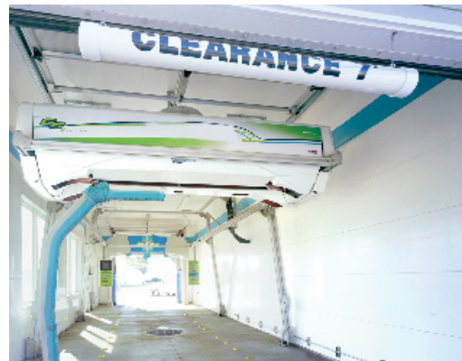
Car Wash Tunnel